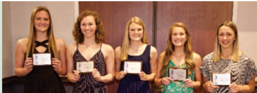
2017-18 Athena Award Recipients

AHEF donors have stepped in to ensure the Athena Award recipient from each of our five high schools is able to attend the Athena Awards Banquet held each Spring in Minneapolis. The Athena Award honors an outstanding senior female athlete from each