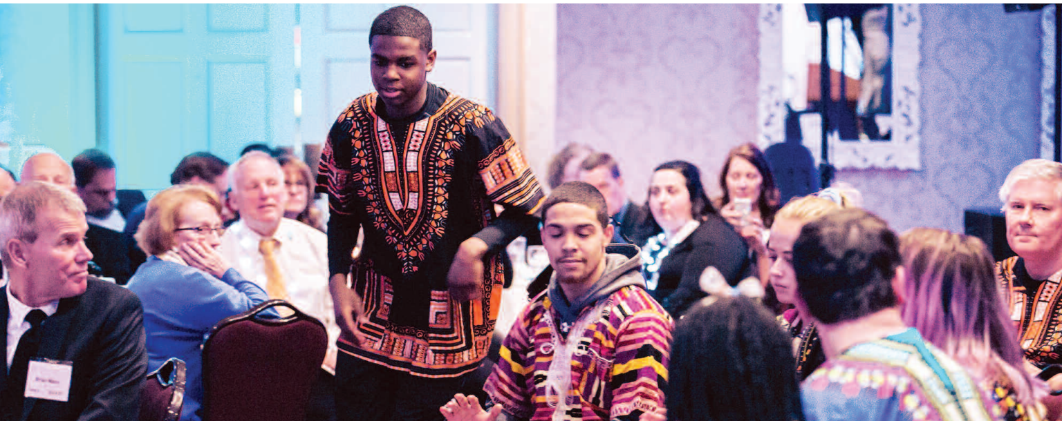
Champlin Park High School students performing at the Northern Stars Celebration

We are thrifty and responsible stewards of our resources and resources of our funders.