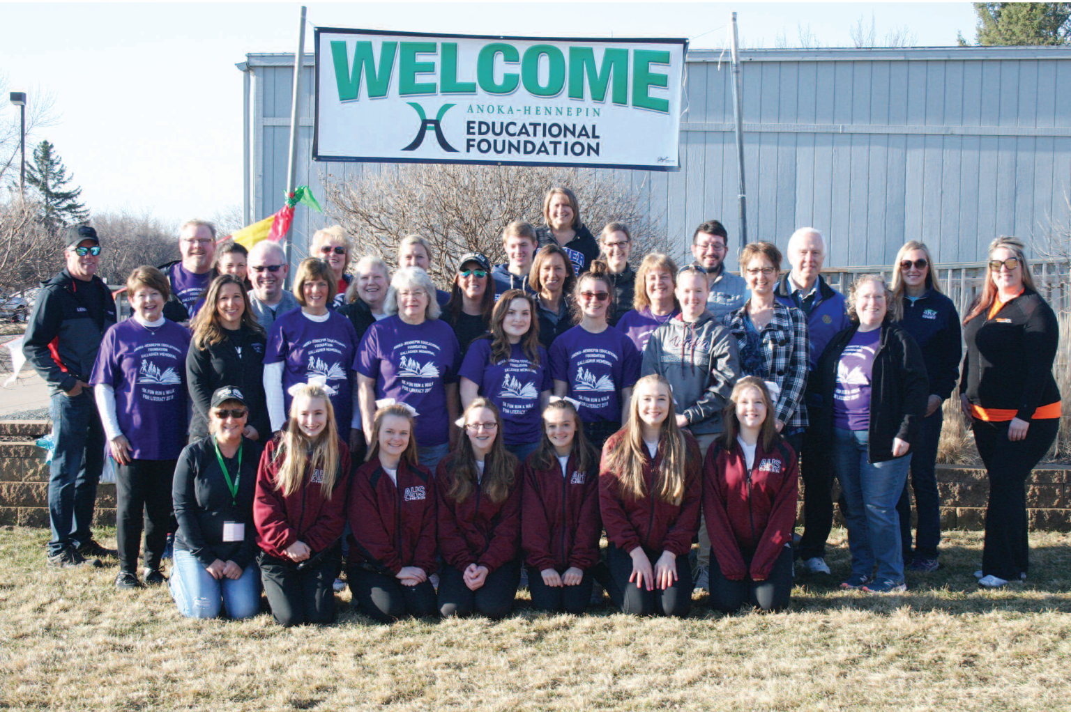
Volunteers at the 2018 Gallagher Fun Run & Walk for Literacy at Anoka High School.

To support and enrich educational opportunities for students in partnership with the district and community.